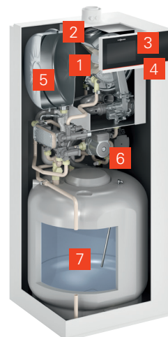
Vitodens 222-F with DHW storage (type B2TE)