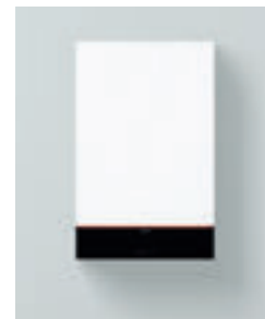
Vitodens 111-W (B1LF)