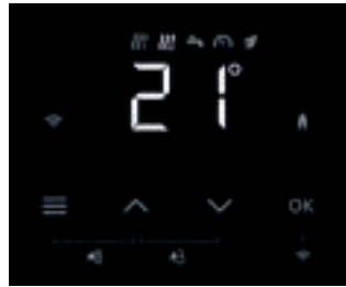
LCD touchscreen display