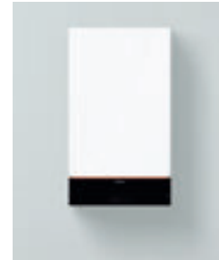
Vitodens 100-W (B1HF und B1KF)